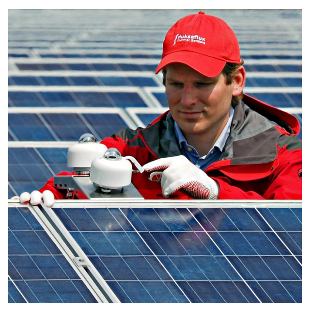
Figure 7 SR30 secondary standard pyranometers with digital output for GHI (global horizontal irradiance) and POA (plane of array) measurements