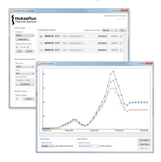
Figure 6 user interface of the Sensor Manager, showing sensor diagnostics

For communication between a PC and SR30, the Hukseflux Sensor Manager software is included. It allows the user to plot and export data, and change the SR30 Modbus address and communication settings. Also, the digital outputs may be viewed for sensor diagnostics.