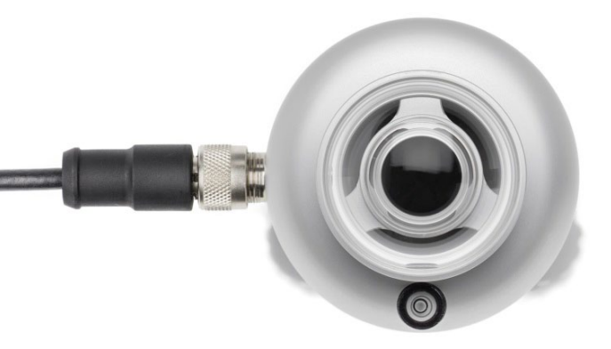
Figure 4 SR30 showing its internal ventilation vents

Standard SR30 offers unique features with clear benefits. SR30 is the only pyranometer to include a tilt sensor and an internal humidity sensor, allowing fast performance analysis.