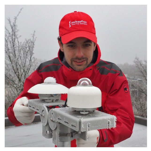
Figure 3 frost and dew deposition: clear difference between a non-heated pyranometer (back) versus SR30 (front)