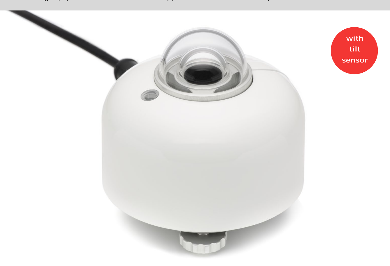
Figure 1 SR30 digital secondary standard pyranometer